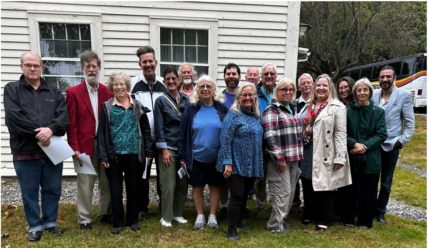
Bus tour attendees at the Peter Rice House in Marlborough